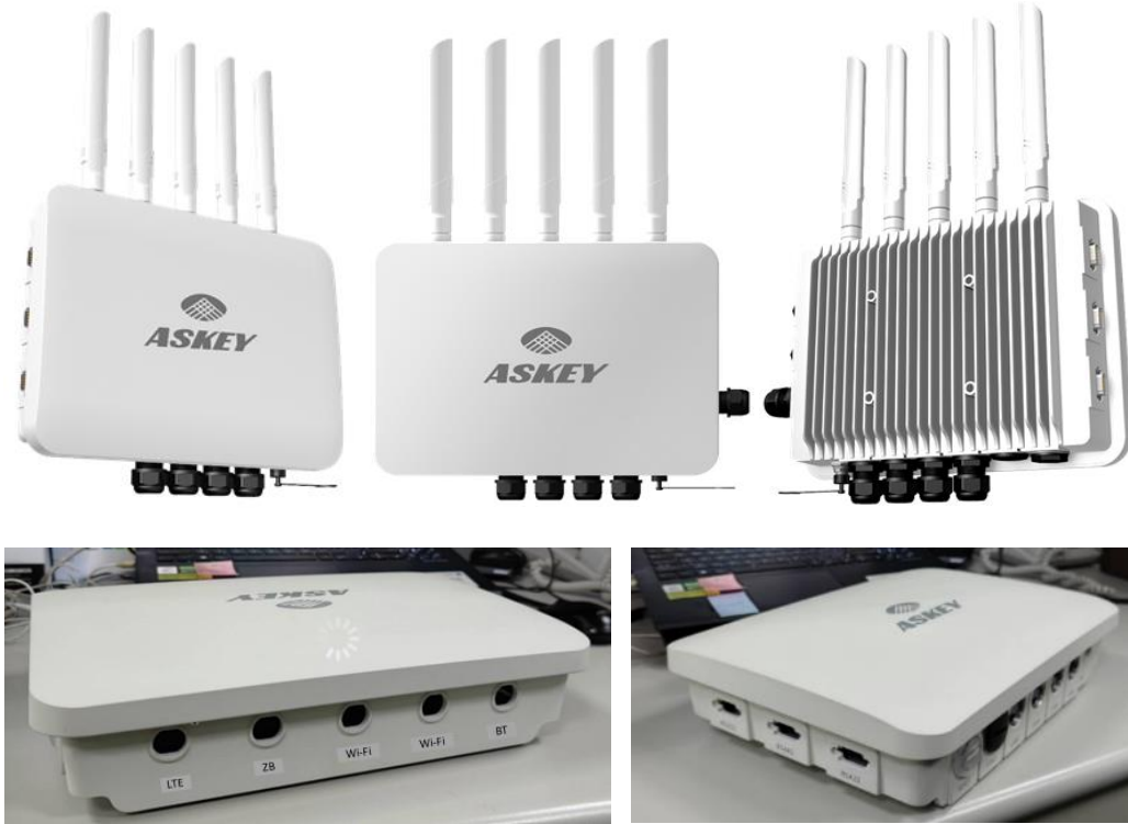
圖 1：物聯網開道器 APL2000W 外觀